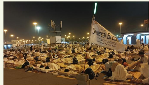
Waqoof in Muzdalfa