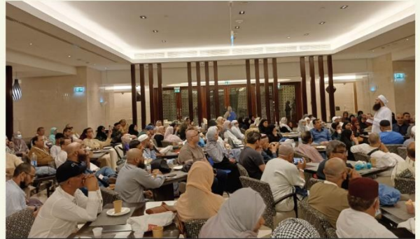
Hajj Briefing in Makkah Hotel