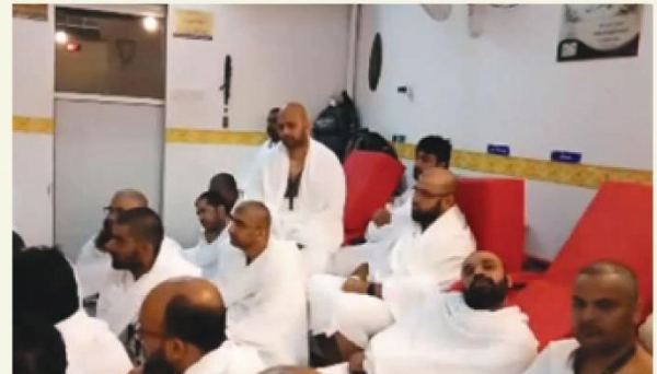
Hajj Briefing in Mina