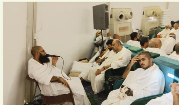
Hajj Briefing in Arafat