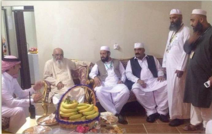
MINA DELUXE CAMP