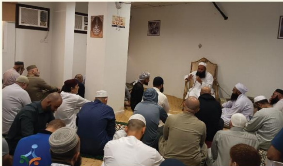
Hajj Briefing in Aziziya Building