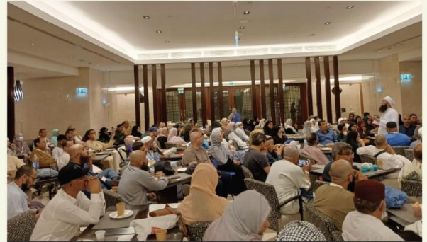
Hajj Briefing in Makkah Hotel