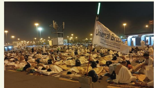
Waqoof in Muzdalfa