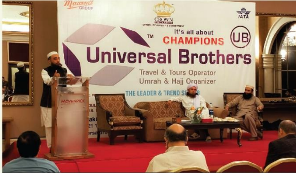
Hajj Briefing in Movenpick