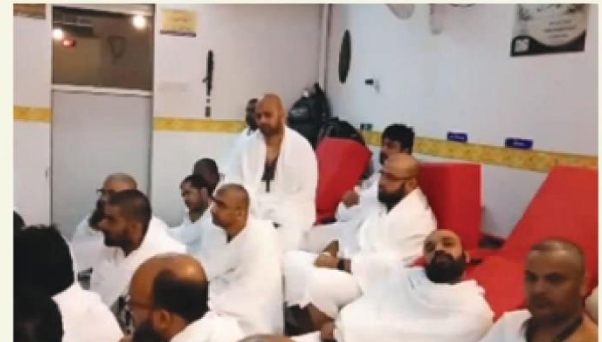
Hajj Briefing in Mina